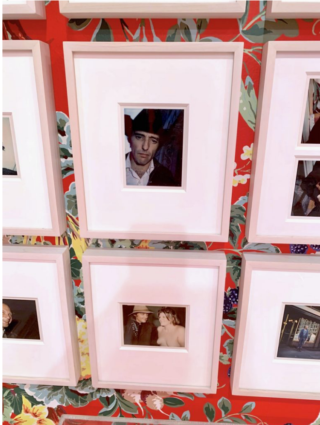
A Brigid Berlin Polaroid of Dennis Hopper in "The Heaviest."