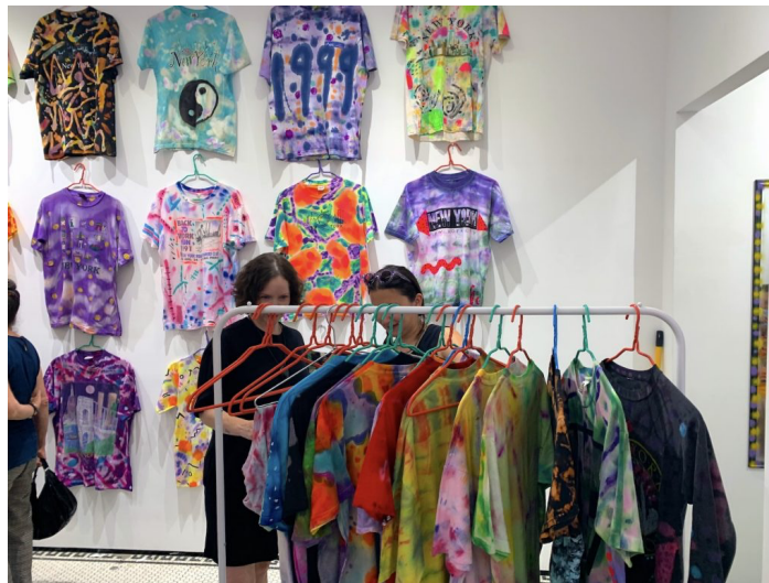
Installation view of Nora Griffin’s “1999 NYC TEE” show at Fierman.

You missed the show, but the shirts have their own Instagram , so join the 1999 NYC Tee club while you can.