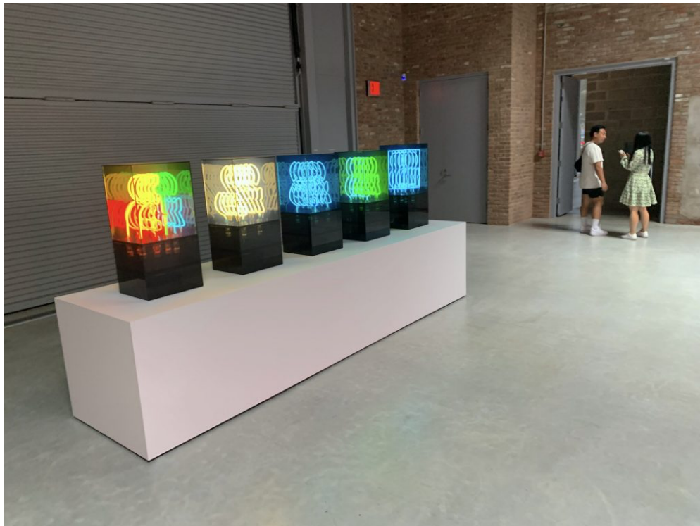
Chryssa, Five Variations on the Ampersand (1966) in "Chryssa and New York" at Dia.

Her act of going by the mononym "Chryssa" itself mirrors her artistic procedure of subtraction and abstraction: adding to a signifier's evocative power by stripping it down and making it mysterious. It also suggests a certain swagger, of course. The sculpture that best incarnates this appetite is her magnum opus, on tour here from the Buffalo AKG Art Museum collection: a 10-by-10 hulk called The Gates to Times Square (1964–66). It is a glorious abstracted "A," in sizzling blue neon. It wants to stun you as a distilled version of the grandeur of New York's commercial center, while also conveying the mystery of an altar of secret texts held just out of reach.