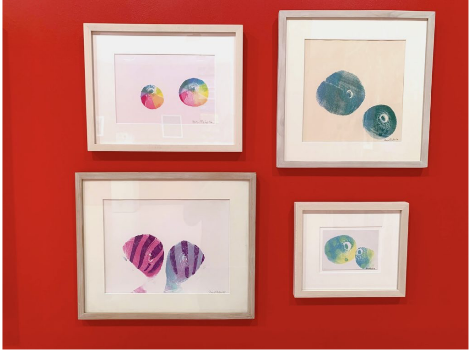
Four of Brigid Berlin's "Tit Prints" in "The Heaviest."