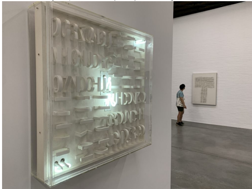
Chryssa, Cycladic Movement (n.d.) and Letter "T" (1959).