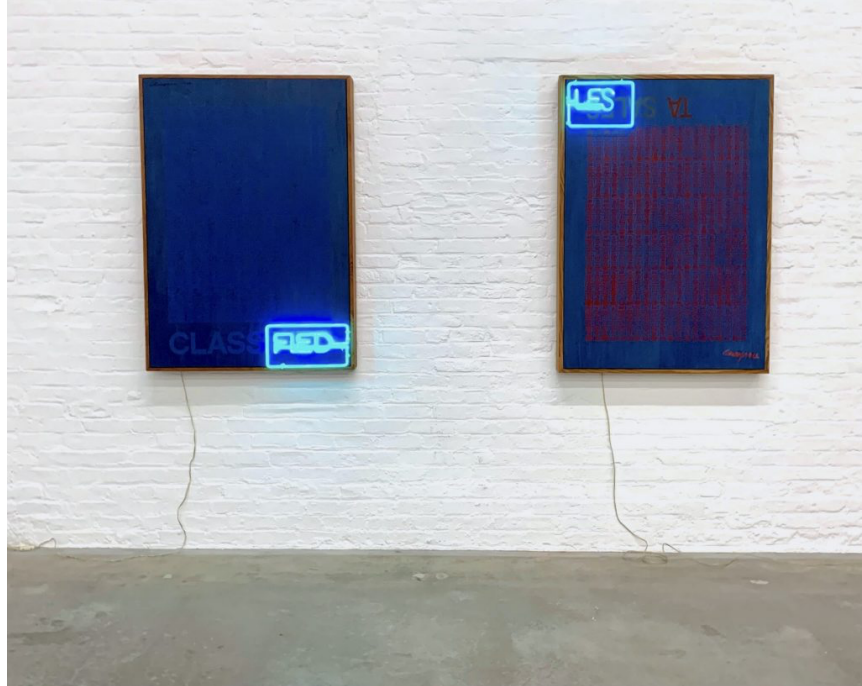
Chryssa, Classified (1960).