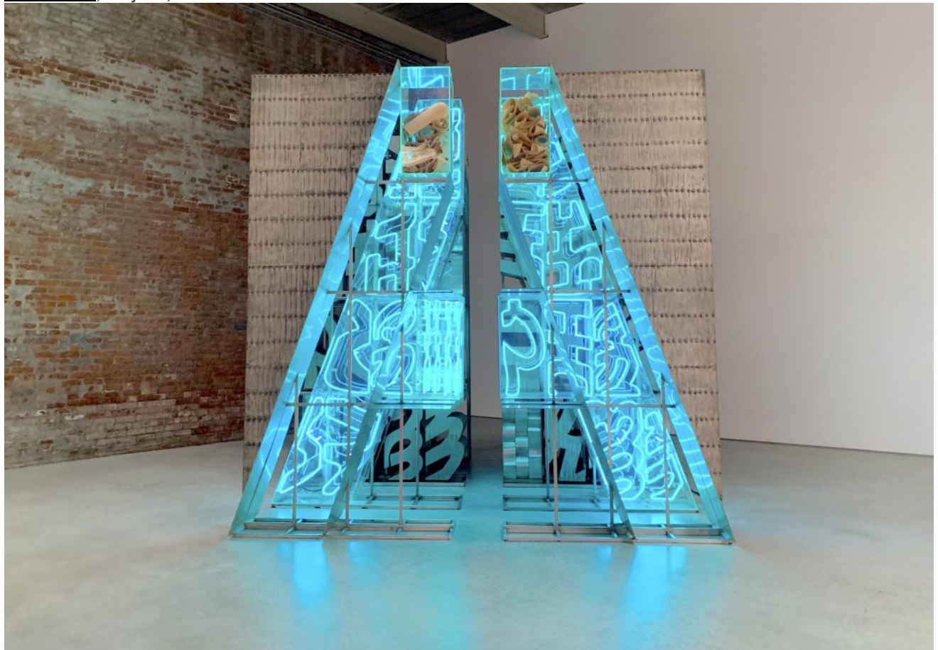
Chryssa's Homage to Times Square (1964-66) at Dia Chelsea for "Chryssa's New York."

"What I'm Looking at" is a monthly column where I digest art worth seeing, writings worth consuming, and other tidbits. Below, thoughts from the first weeks of July 2023.