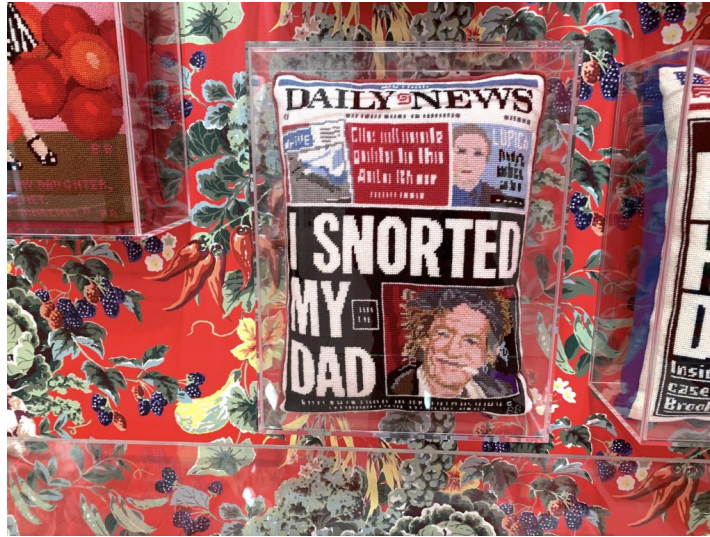
Sampler by Brigid Berlin in “The Heaviest.”