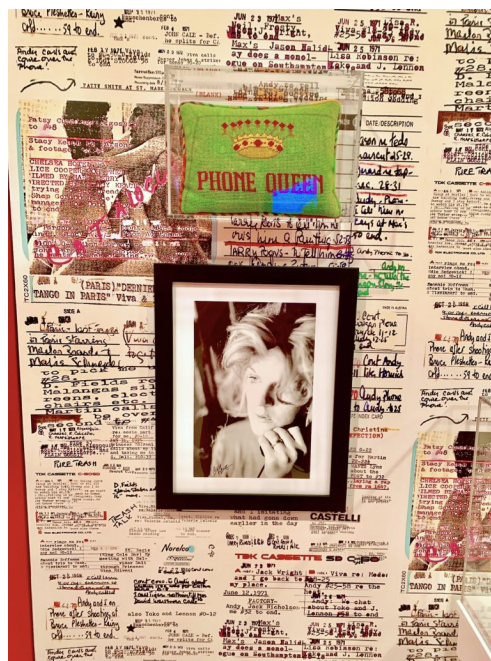
Brigid Berlin material in “The Heaviest.”

The show is a fascinating look at a life. As to the art as art, the evidence of the show leaves me feeling of two minds. On the one hand, it does feel like appreciating Berlin’s output depends substantially on your interest in a certain form of micro-celebrity. But, then, this self-mythologizing sensibility does resonate now, feeling very contemporary in its indulgent eclecticism, defensive bravado, and undercurrent of melancholy.