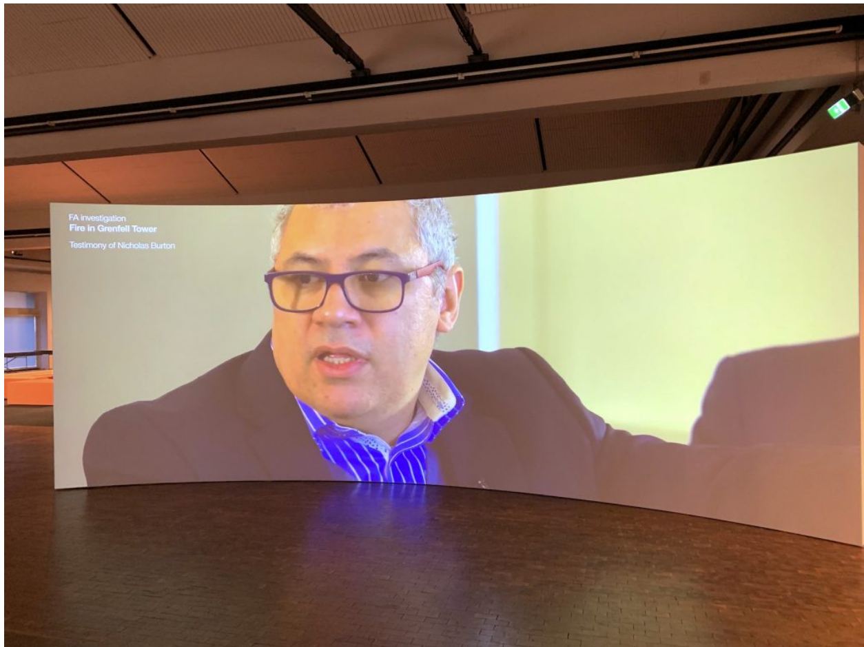
Forensic Architecture, Cloud Studies (2021) in the Berlin Biennale.

But what I realized, watching Cloud Studies a second time, is how much the video's effect depends on that pre-existing agreement on my part. In its own description of itself, it is not doing something so ordinary as making a case: "our 'cloud studies' meander between shape and fog, between analysis and experience."