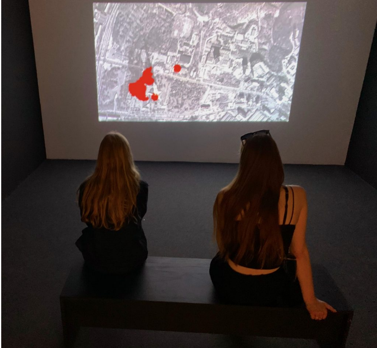
Forensic Architecture, Airstrike on Babyn Yar (2022).

“We gathered over dozens of videos, maps, and archival materials in order to study how these strikes hit not only media and communication networks but a tangled nervous system of historical references and repressed memories,” the narrator intones, in clinical voice. Airstrike on Babyn Yar goes on to detail how the Russian missile attack on the TV tower also hit the nearby Babyn Yar Holocaust Memorial, pointing out the symbolic significance of this fact as linking two atrocities.