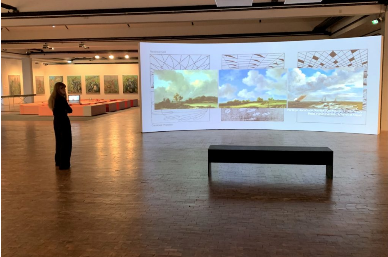
Forensic Architecture, Cloud Studies (2021).

At one point, the video compares the work Forensic Architecture has done building computer models analyzing different explosions to the 19th-century tradition of “cloud atlases” created by amateur meteorologists, or to atmosphere studies created by landscape painters. But Cloud Studies ’s real point is political: the tour of Forensic Architecture’s various initiatives is, in effect, an argument that all these struggles are one: “we the citizens of toxic clouds must resist in common action.”