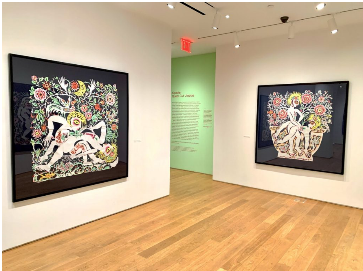
Installation view of “Xiyadie: Queer Cut Utopias” at the Drawing Center.