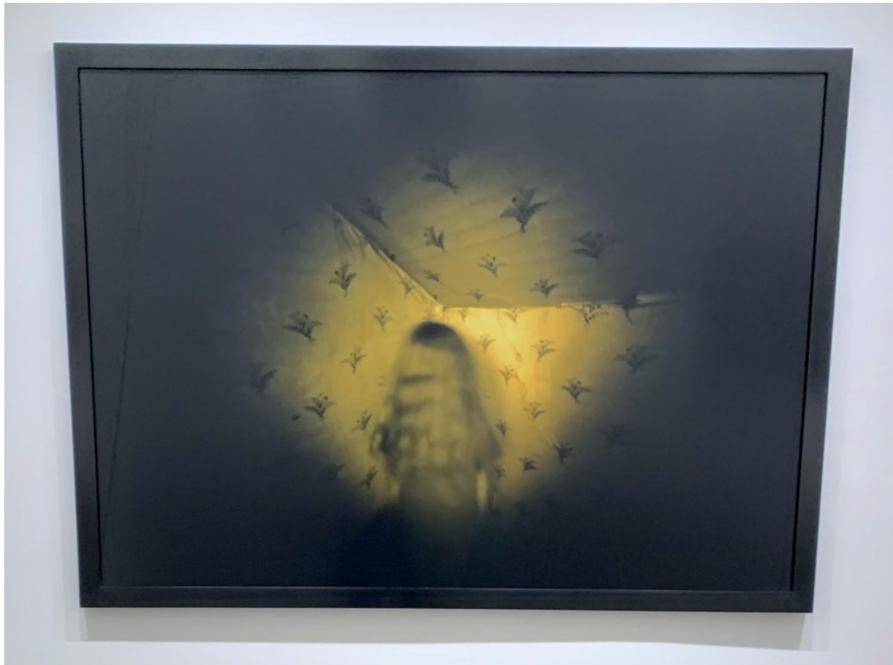
Barbara Ess, Girl in Corner (1997-98).

The Verdict: Move over Dimes Square, Times Square is where the cool kids are at!!