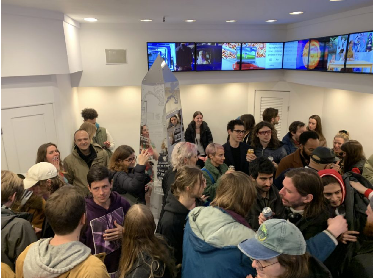
The opening “Manic American Humanist Show” at Public Works Administration.

The Verdict: The kind of show that feels both like a secret to defend and a cause to evangelize to everyone you know.