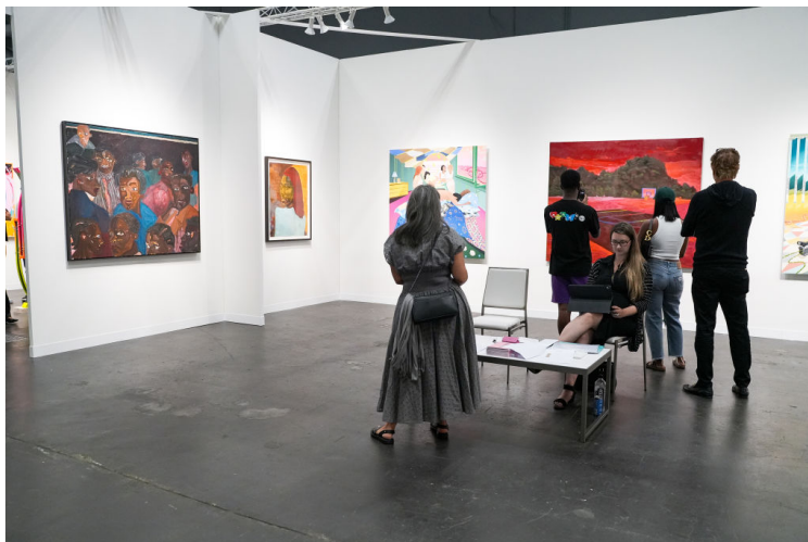
Luce Gallery at the 2023 Armory Show VIP Preview at Javits Center on September 07, 2023 in New York City.

What does it mean? My guess is that it represents a flight to the safety of the easiest sales pitch: art as investment-grade décor. Given the deep economic queasiness behind the scenes in the art world right now, that is how I am interpreting the “painting, painting, painting” moment, rather than as a real renaissance of contemporary painting. It’s an odd effect—all this genial, colorful painting expressing all that nervousness underneath.