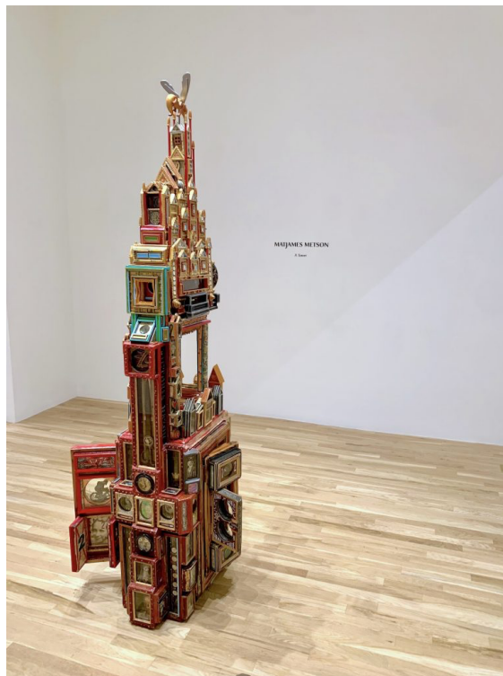
Matjames Metson, A Tower (2023) at George Adams Gallery.

It's full of scrappy flourishes: little pocket knives displayed in tiny windows, details made of pearl buttons, rows of sharpened pencils that resemble Gothic ornament, collaged bits of old love letters salvaged from estate sales. A Tower seems to be a structure almost literally built out of memories of a world of tactile creativity. It's just very fun to spend time circling it, looking for all the little secrets Metson has nested within all its crannies and compartments.