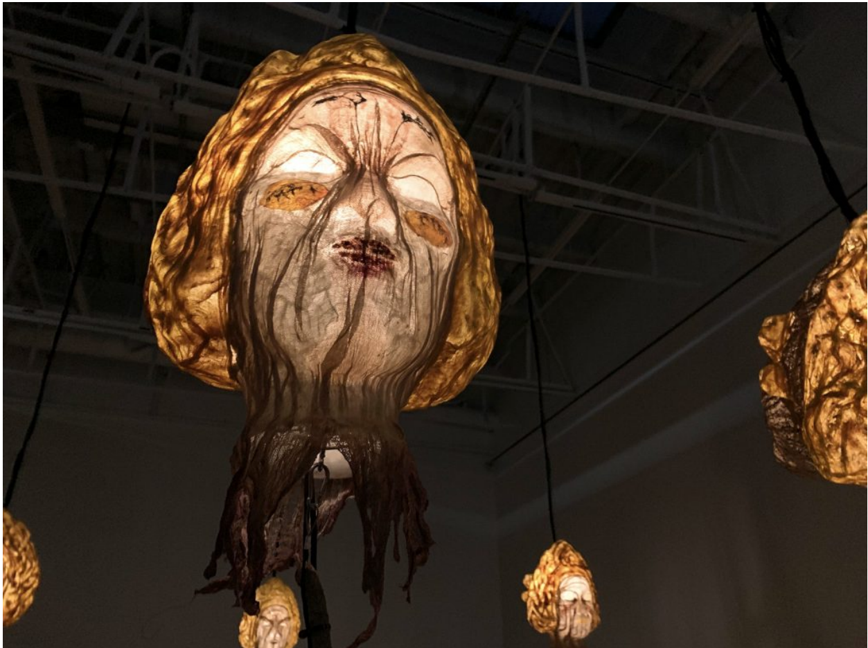
Detail of Amy Lien and Enzo Camacho, waves move bile (2020).

And then, at moments, it comes to life. A mechanical fish on a plate periodically jerks around. Cups on the table suddenly shift as if haunted. These offbeat animated touches made me laugh out loud. The jolt of startled amusement was disproportionate, as if these comic moments gave vent to a secret current of emotional energy running underneath this whole show.