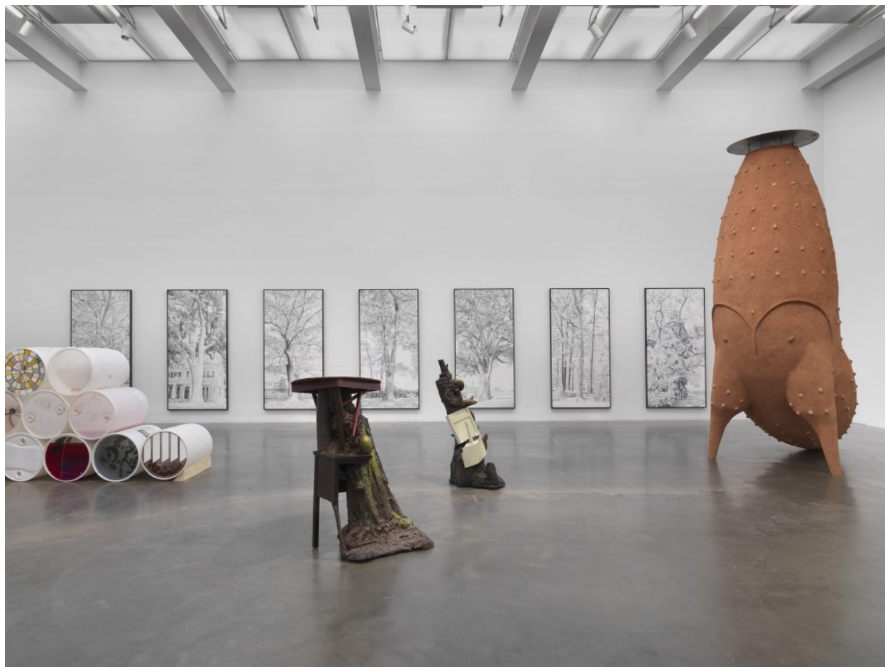
"2021 Triennial: Soft Water Hard Stone," 2021. Exhibition view: New Museum, New York.