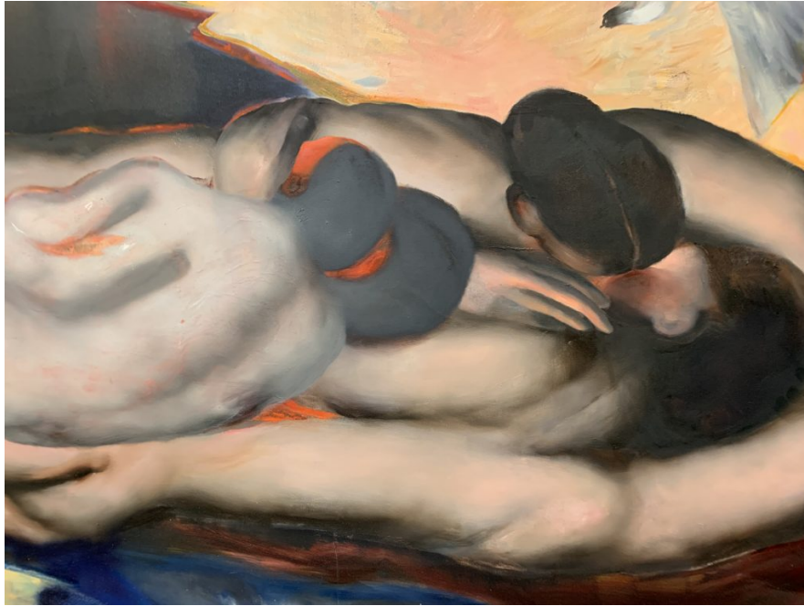
Detail of Ambera Wellman's Strobe (2021).

landscapes that turn out, when you read the label, to be sites of violence during the Civil War.