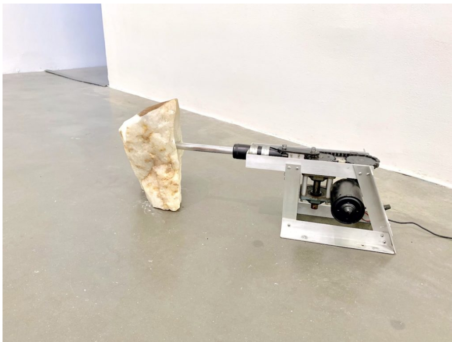
Gabiela Mureb, Machine #4: stone (ground) (2017).

On the other hand, there are multiple things with rotting or biological matter, as if to evoke real physical nature, and multiple things that evoke broken machines, as if flagging a sense of the post-industrial wreckage left behind by the frenetic entertainments of the digital economy.