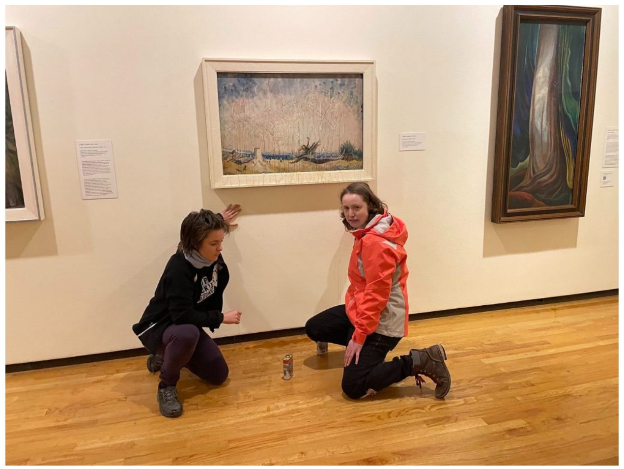
Two climate activists for Stop Fracking Around throw maple syrup at a painting by Emily Carr at Vancouver Art Gallery on Saturday November 12, 2022.

their longer-term viability by forcing them to become the worst version of themselves just to get a media hit.