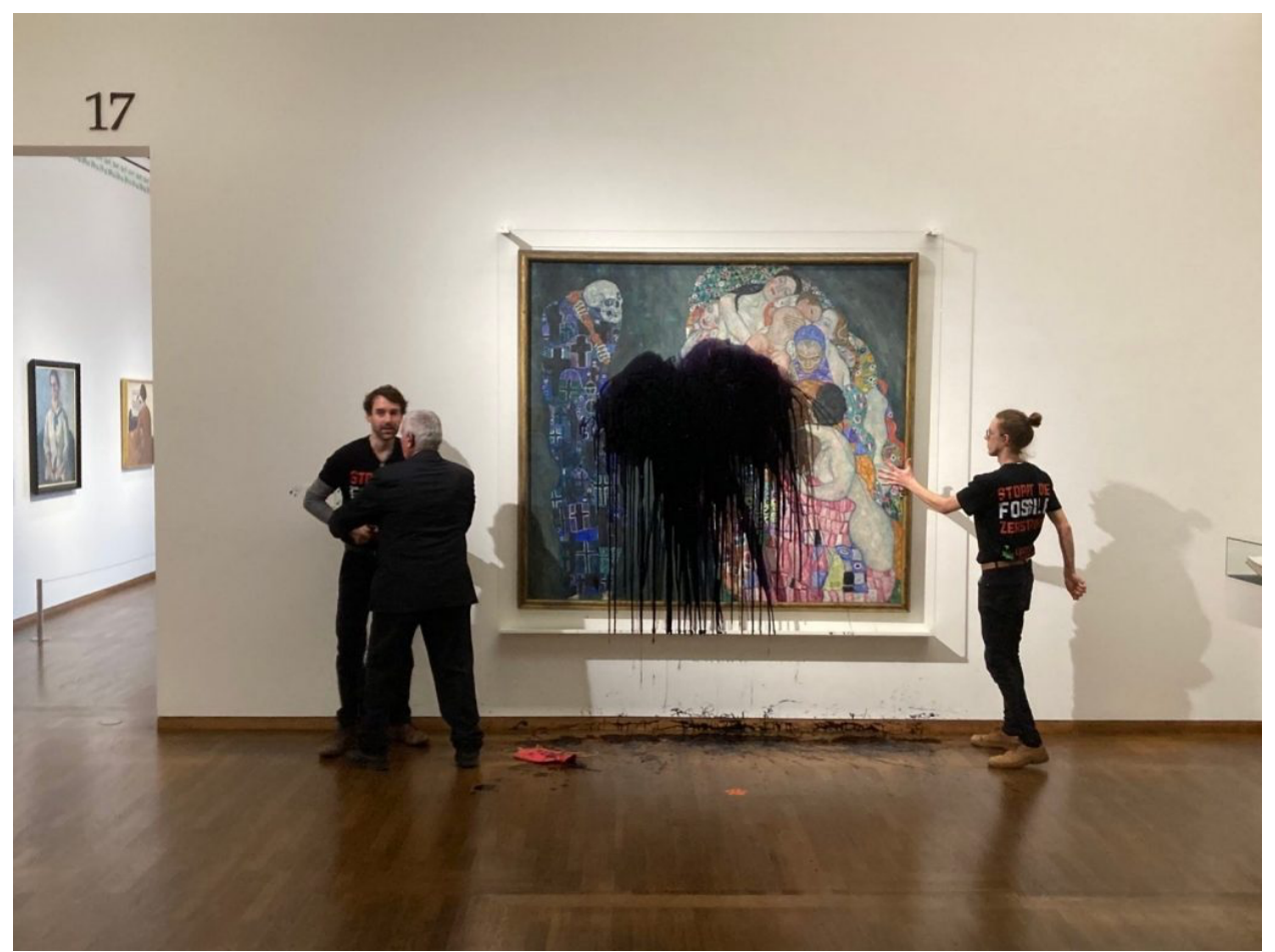
Two activists for Letzte Generation (Last Generation) throw "a black, oily liquid" at a painting by Klimt at the Leopold Museum in Vienna on November 15, 2022.

The rising tide of environmental activist attacks on artworks has fueled a lot of attention for the cause—that much is clear.