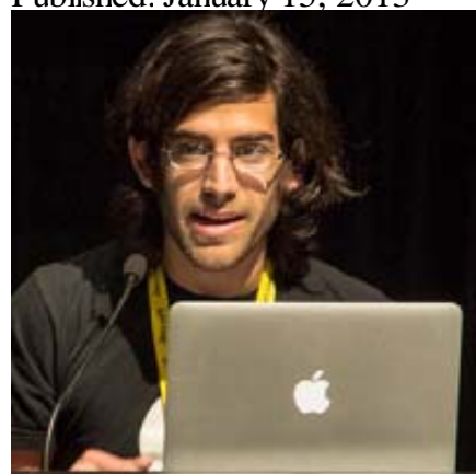
Aaron Swartz