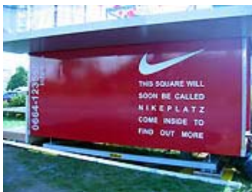
Kiosk for 0100101110101101.ORG's "Nike Ground" project in Vienna, 2003

very occasionally, take note of it and try to make sense of its ambiguous combination of Euro imagery and all-American militarism.