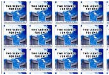
One of 0100101110101101.ORG's "Hybrids," 1999-2001