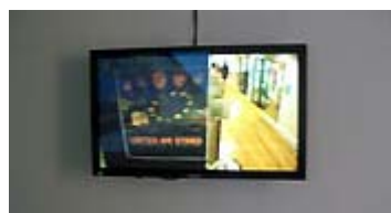
Live web cam feed for "United We Stand" at Postmasters Gallery, 2005