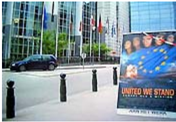
United We Stand poster outside European Union headquarters in Brussels, Belgium