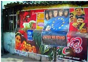
United We Stand poster in Bangalore, India