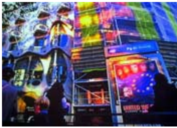
United We Stand poster outside Antoni Gaudí's Casa Milà in Barcelona, Spain