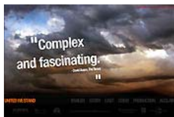
Screen capture from the official "United We Stand" website at www.unitedwestandmovie.com