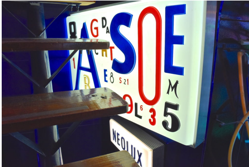
Detail of signage in Marta Minujín's Menesunda Reloaded at the New Museum.

giant dial of a rotary telephone, which might as well be an artifact from an alien dimension in the post-smartphone epoch.