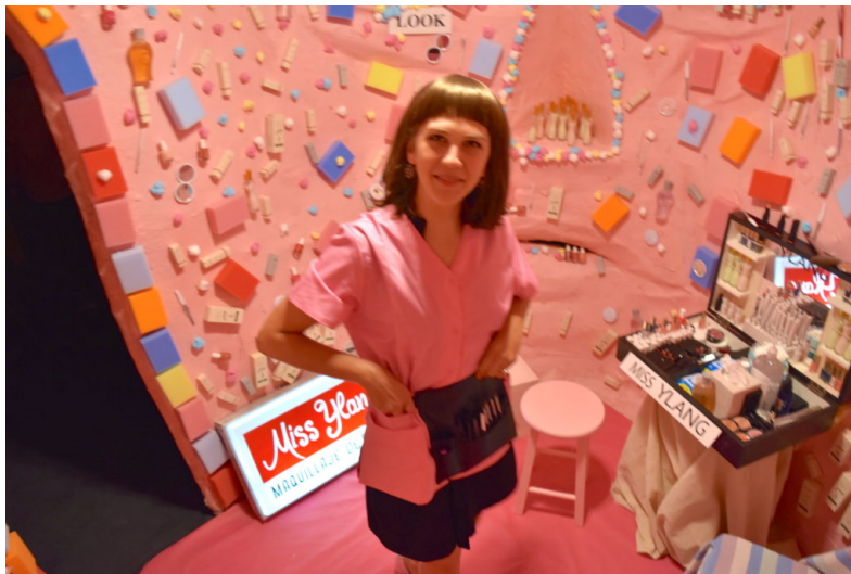
Descending into the makeup room in Menesunda Reloaded at the New Museum.

Then, you swing through a bedroom decked out in pointedly low-key period decor. A couple of live actors are languishing in bed, half dressed and chilling out, murmuring to each other, listening to the Beatles.