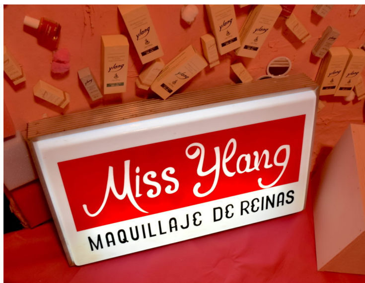
Detail of signage in the Woman's Head room in Marta Minujín's Menesunda Reloaded at the New Museum.

As a result you have to view Menesunda Reloaded as a kind of stereoscopic experience, its past-ness and its present-ness coexisting uncomfortably in your head as you traverse its rooms. I say uncomfortably, because there is a way in that the picturesque charm of its period vibe actually slightly shields you from its original cutting edge.