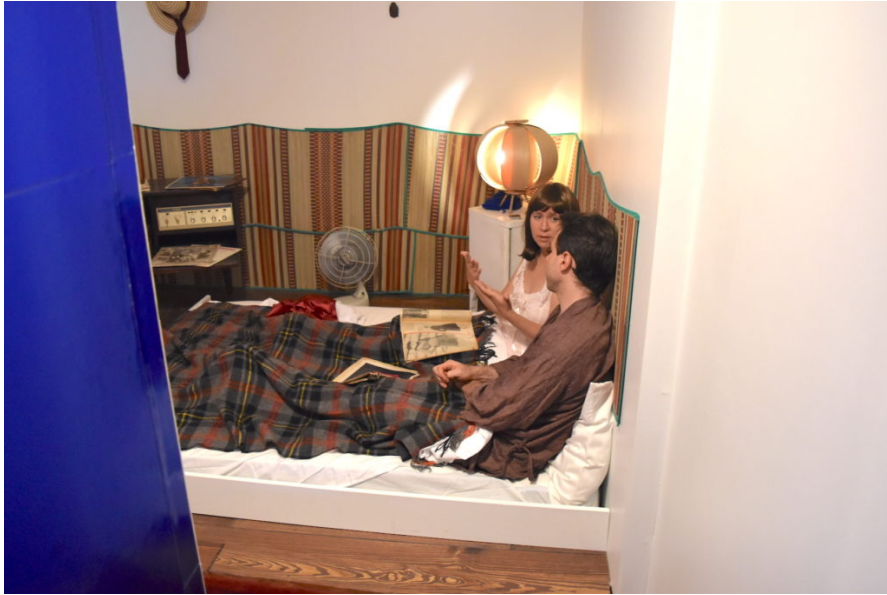
Two performers in Menesunda Reloaded at the New Museum.

The phrase “La Menesunda” is Argentine slang for a chaotic, confusing situation, and the installation set out to push the limits of what its contemporaneous audience—accustomed to a more churchy style of high culture—would bear. It immediately puts you into an environment that evokes urban life: You enter a chamber of multicolored neon, and climb stairs to a passage with a bank of TVs playing black-and-white news programming.