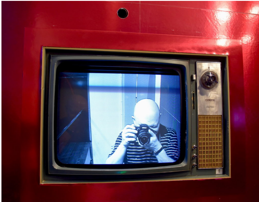
Closed circuit footage in Marta Minujín's Menesunda Reloaded at the New Museum.

The final version did not involve torture or pooping in a hole. But it was meant to be discomforting and literally challenging as well as tactile and engaging. The rooms are designed to make you work, to duck through doors, to go across unstable floors, to literally crawl in one case.