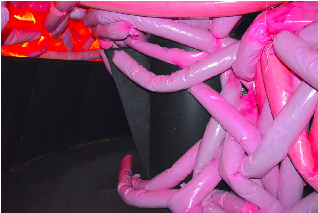
The intestine room in Marta Minujín's Menesunda Reloaded at the New Museum.

From there you descend stairs into a salon, where you can get your hand painted by a pink-clad attendant. The walls of the spherical chamber are encrusted with bottles of nail polish and other makeup instruments, and it's all very candy-colored and knowingly kitschy. (Though it's worth mentioning that this room, called the Woman's Head , represents a not-exactly-sisterly statement about the gender politics of its day: "I hated housewives," Minujín says in the catalogue. "I wanted to tell them that all they had in their heads was makeup.")