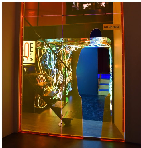
Entrance to Menesunda Reloaded at the New Museum.

But La Menesunda , with its more early-'60s aura of tactile hedonism and media experimentation, actually better represents what made Minujín's reputation.