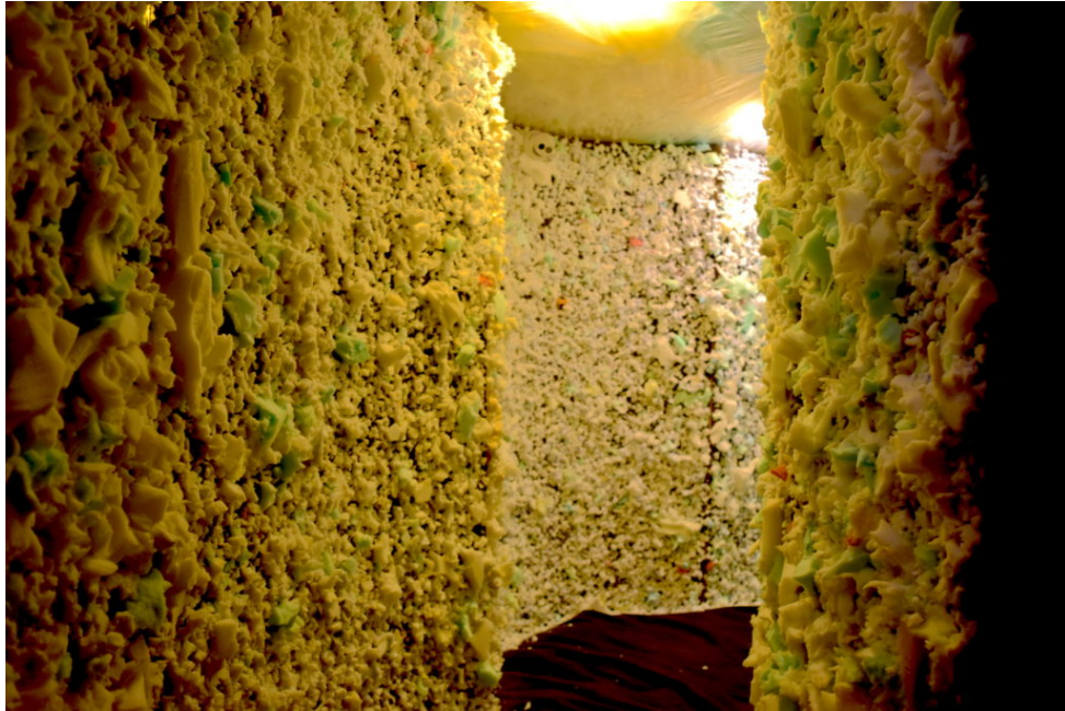
The hall of sponges in Marta Minujín's Menesunda Reloaded at the New Museum.

You conclude in a mirrored octagonal room with a plastic booth at the center. Stepping on a pressure pad in the booth switches the lights to a nightclubby purple and turns on fans that fill the air with flurries of confetti, as if you have just won a prize at a DIY gameshow.