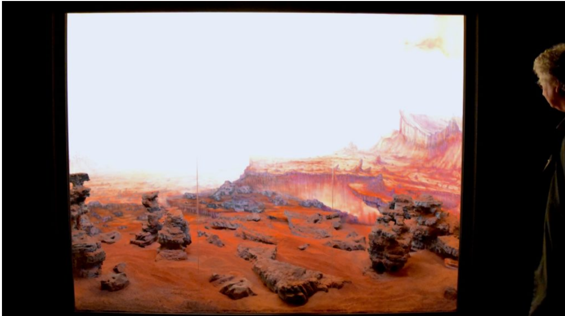
Dominique Gonzalez-Foerster, Joi Bittle (2018).