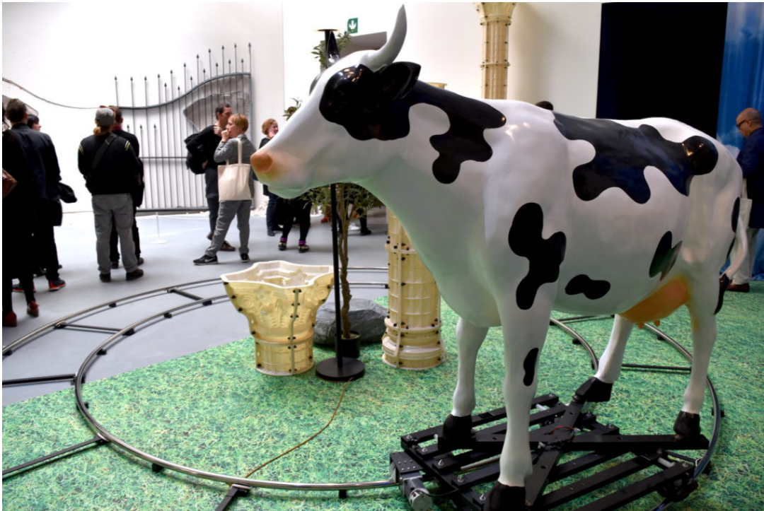
Nabuqi, Do real things happen in moments of rationality? (2018).

When I actually take the time to categorize all the art in the show according to theme, I find this overall impression is misleading. There's actually more of what I'd call "funky formalism" or "enigmatic imagism" than art that explicitly deals with eco-tastrophe or techno-dystopia.