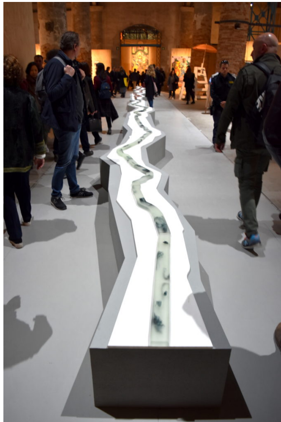
Otobong Nkanga, Veins Aligned (2018).

Still, ideally biennials are more than pleasant. Ideally they define a zeitgeist through the filter they put on contemporary art in general and the juxtapositions they specifically create: the late Okwui Enwezor's 2015 version was all about the heightening of political claims for art and re-centering on the non-Western; Christine Macel's 2017 version now seems to have been prescient in its focus on a yearning for art as healing ritual. Rugoff's curatorial declarations about “ambiguity” do not seem that promising for the event's trendsetting purpose. It would seem to be a non-thought about a non-theme.