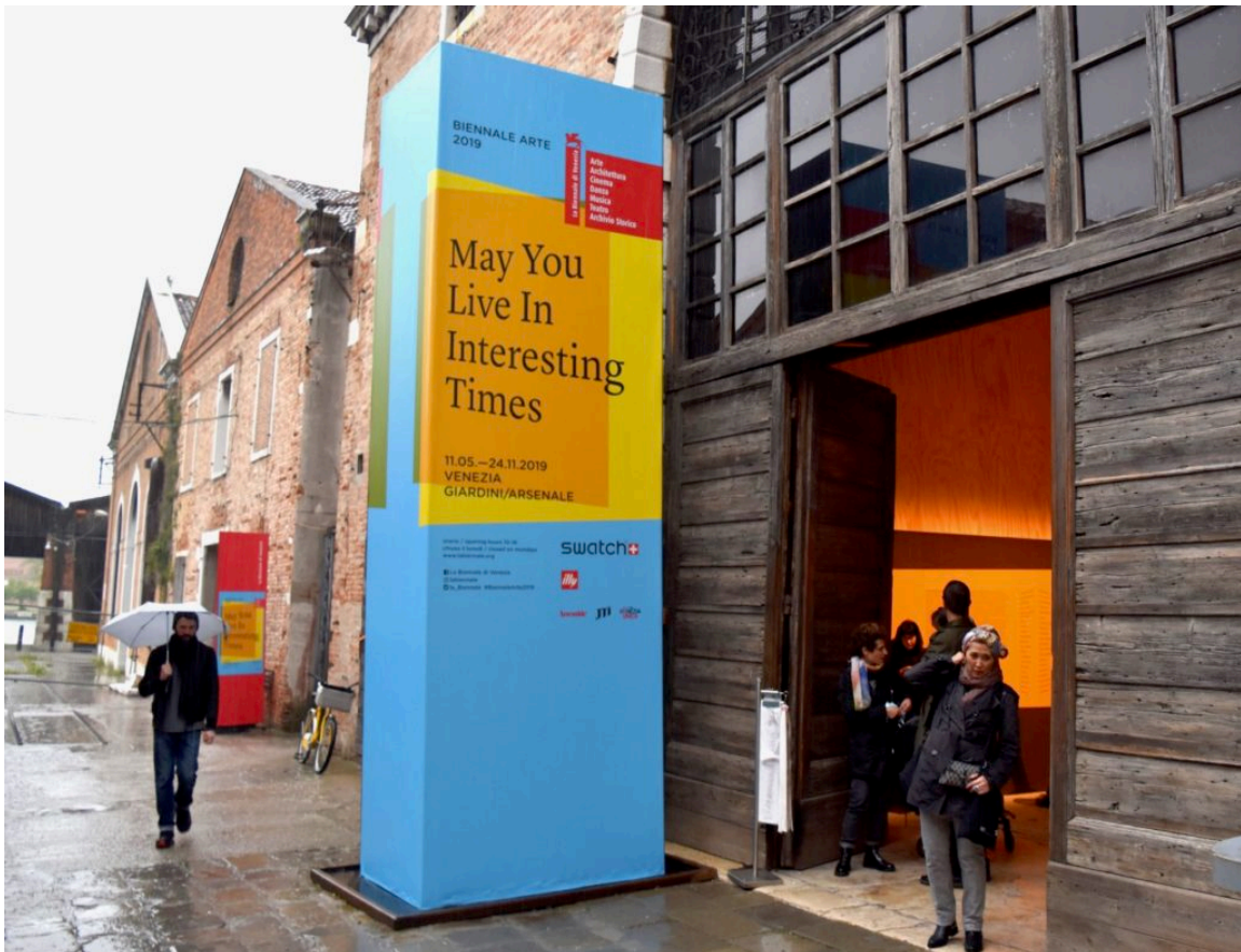
The entrance to the Arsenale for the 2019 Venice Biennale.