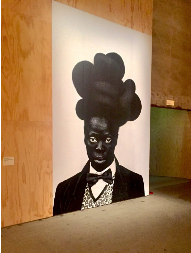
Zanele Muholi, Phaphama, at Cassilhaus, North Carolina (2016).

In the Arsenale, South African photographer Zanele Muholi 's starkly black-and-white blown-up self-portraits stand as punctuation marks throughout the show.