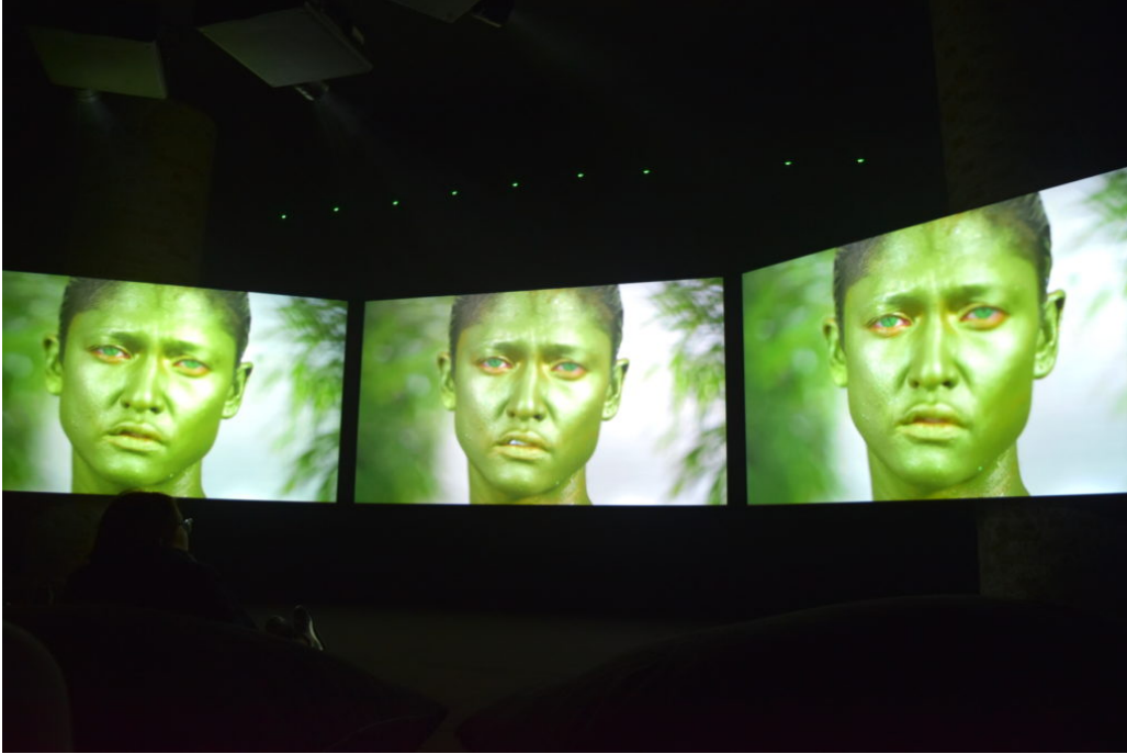
Korakrit Arunanondchai, No history in a room filled with people with funny names 5 (2018).

But most of the positive energy is carried, here, by the notion of “redemptive representation.” The coolest spin on the theme may be LA-based filmmaker Kahlil Joseph’s BLKNWS project, installed at various sites around the two shows, which imagines an experimental news channel, equal parts funny and brainy and bracing, about African American culture.