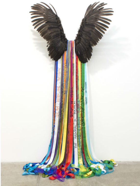
Andrea Bowers, Goddess (Power of the Common Public) (2016).

When activism finds its way into the art gallery, the house style is what Paige Sarlin calls " new left-wing melancholy ," or what I think of as "post-radical chic:" neutralized and neutralizing, mining the paraphernalia of protest for historical pathos. This is not the way Andrea Bowers operates, as you can confirm for yourself if you visit the LA artist's show at Andrew Kreps Gallery in Chelsea, dubbed " Whose Feminism Is It Anyway? "