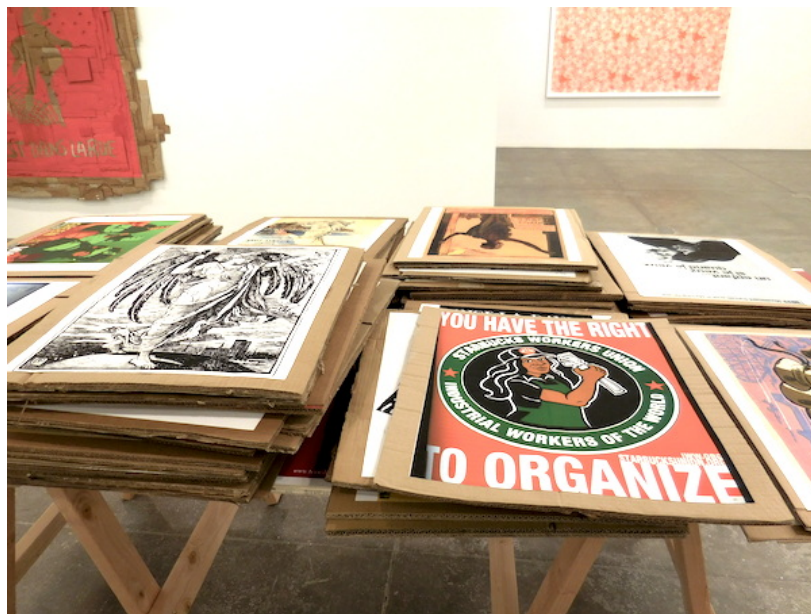
Historical activist graphics at Andrew Kreps.

In terms of media, "Whose Feminism Is It Anyway?" is disparate, the works mostly connected to the theme of transgender liberation, a cause which Time in 2014 famously dubbed the "next civil rights frontier." It includes small graphite drawings, large scruffy marker-on-cardboard constructions, and an assemblage incorporating angel wings and ribbons with feminist and trans-rights slogans on them, such as "My Body, My Choice," and "Trans Is Beautiful."